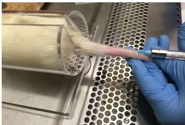
Figure 1. Subcutaneous Injection at the Base of the Tail